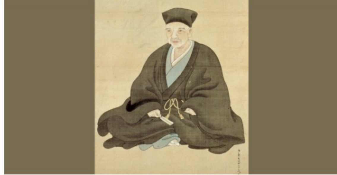
Sen no Rikyu